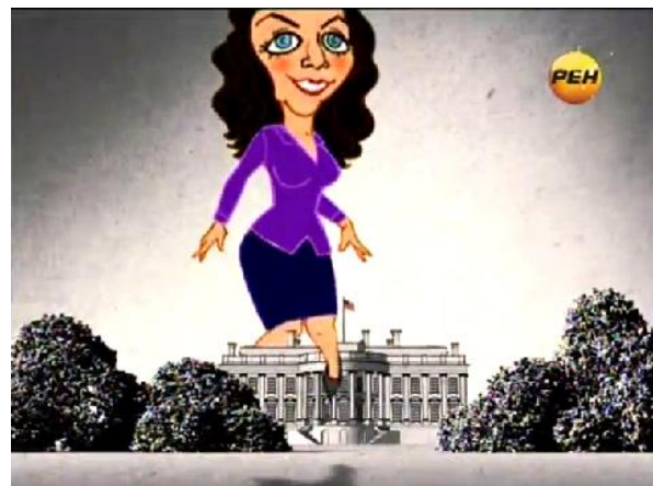
Simonyan steps over the White House in the introduction from her short-lived domestic show on REN TV (REN TV, 26 December 2011)