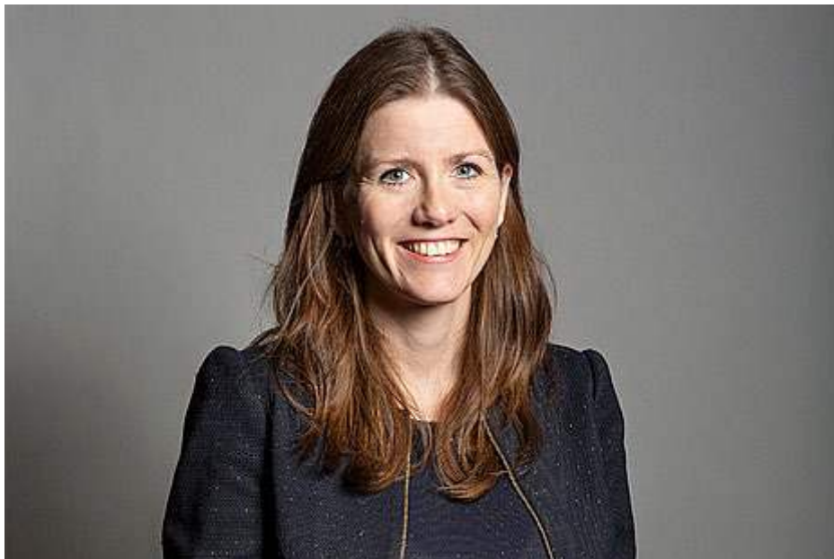
The Rt Hon Michelle Donelan MP, Secretary of State for Science, Innovation and Technology

I believe that a common-sense, outcomes-oriented approach is the best way to get right to the heart of delivering on the priorities of people across the UK. Better public services, high quality jobs and opportunities to learn the skills that will power our future – these are the priorities that will drive our goal to become a science and technology superpower by 2030.