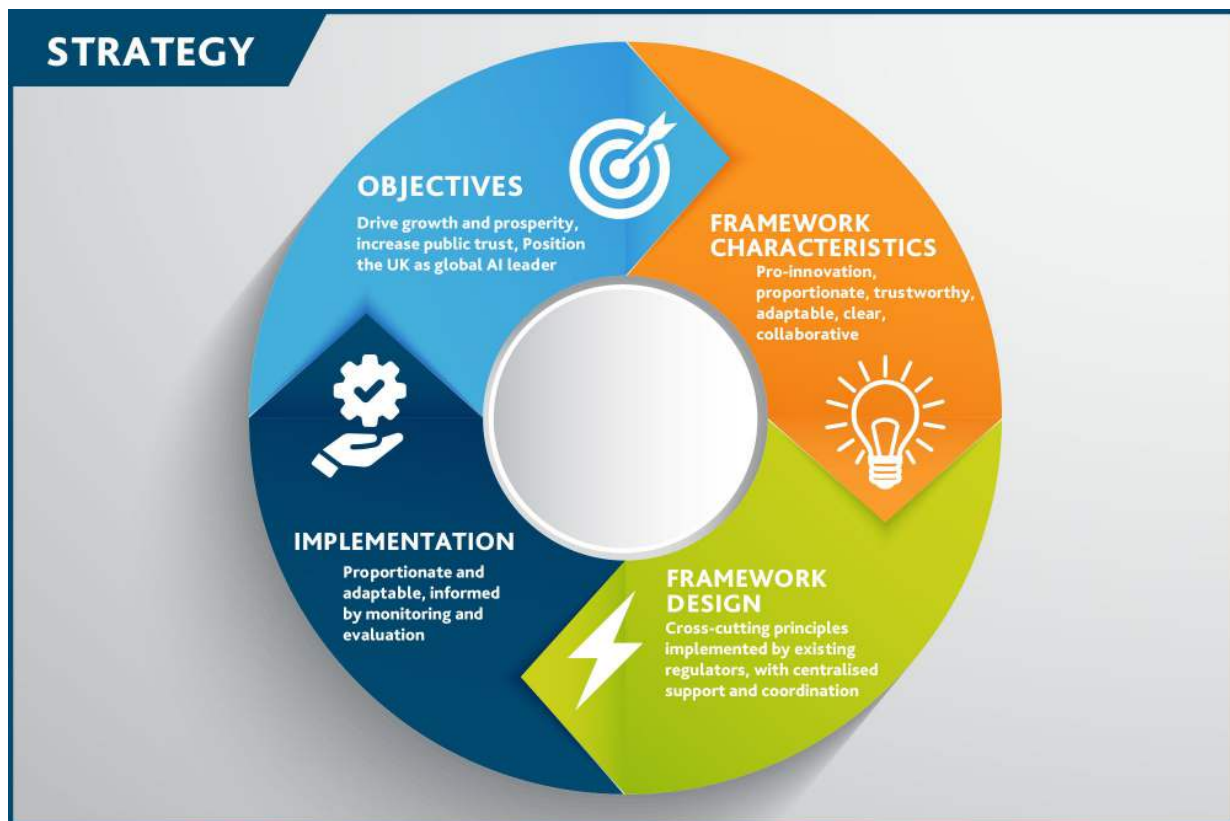
Figure 1: Illustration of our strategy for regulating AI